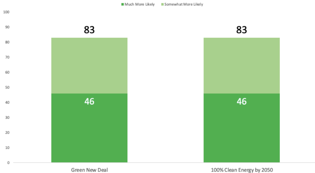
Figure 3. Likelihood to Support a Democratic Presidential Candidate Who Supports Each Plan – Brief Descriptions

Early primary voters have strong positive reactions to candidates who support these ideas because they view the policies themselves extremely favorably. Sizeable majorities view the Green New Deal favorably (74% favorable; 54% very favorable) as well as Moving to 100% clean energy by 2050 (82% favorable; 62% very favorable). The detailed description of the Green New Deal was taken closely from the Justice Democrats website and the full descriptions of both ideas are included below. 2 It is important to note that a majority of voters (50%) say that they “like both plans equally and I would support a candidate who favors either one.”